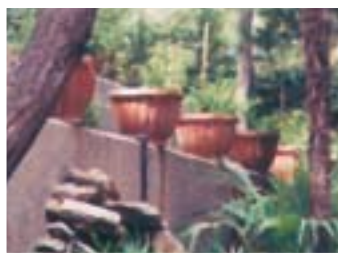
Ernie Baird's winning garden includes a pleasing combination of tranquil water features, container gardens and lush landscaping.